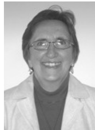
Harry A. Fagan Award Recipient:

With Award Reception & Dinner Featuring: