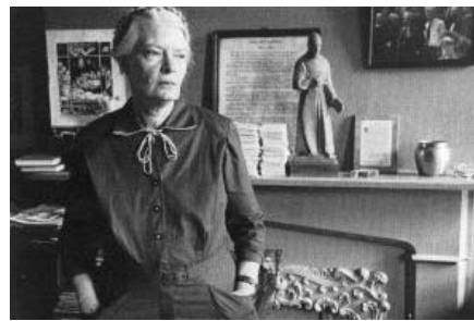
Dorothy Day, Servant of God, in her New York Catholic Worker office in the 1970's.

The canonization process begins at least five years after the death of a candidate. This is to allow greater