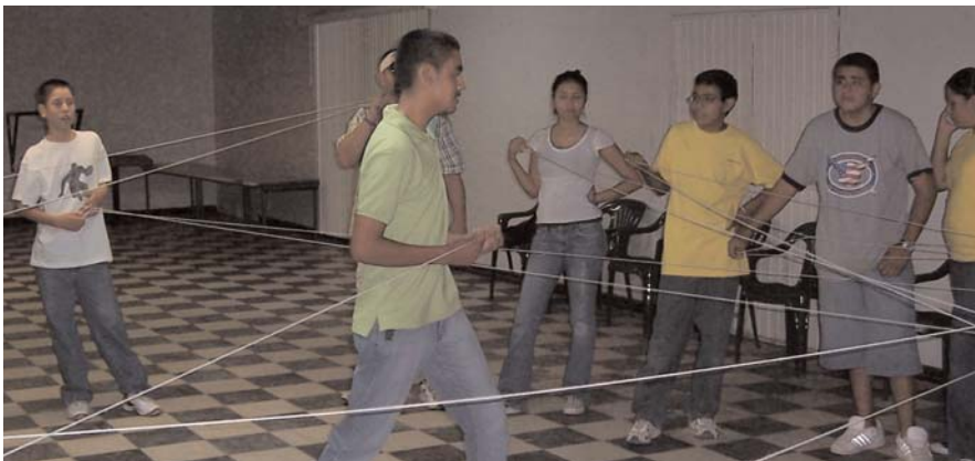
Teens from the Archdiocese of Hermosillo show Diocese of Phoenix youth the web in Christ that binds us all together.